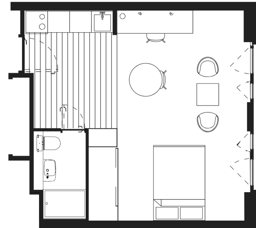
(Typical L1 Floorplan)